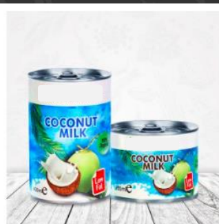
ORGANIC & FAIR TRADE COCONUT MILK 6% LOW FAT