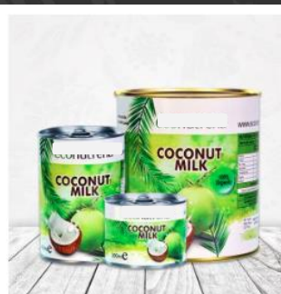
ORGANIC & FAIR TRADE COCONUT MILK 17% FAT