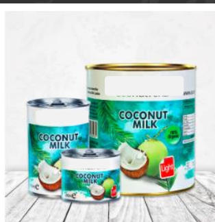
ORGANIC & FAIR TRADE COCONUT MILK LIGHT 9%