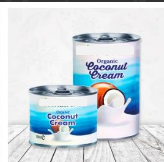
ORGANIC & FAIR TRADE COCONUT CREAM 20% FAT